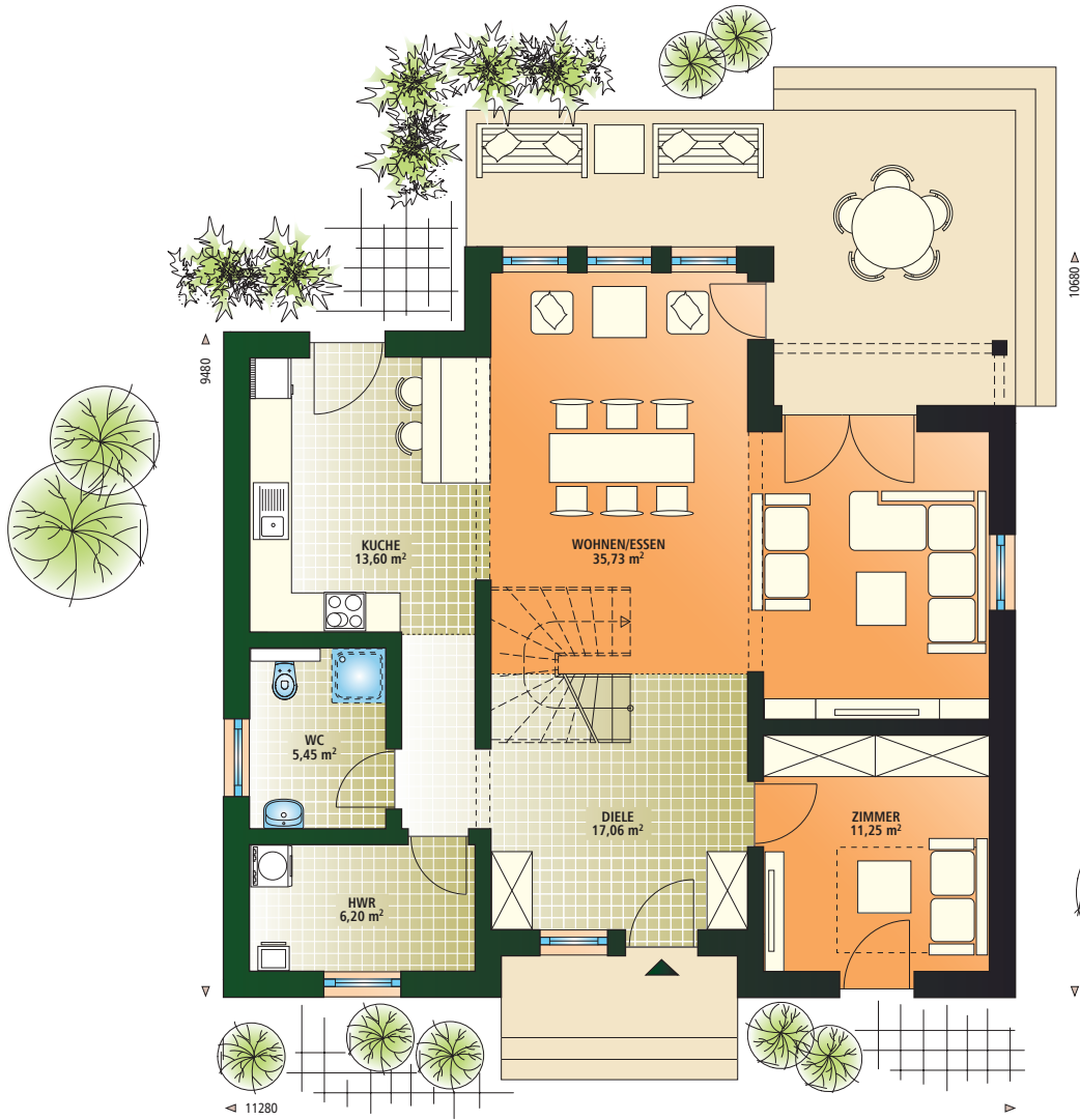
ERDGESCHOSS 89,29 m 2