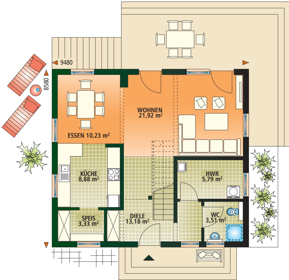
ERDGESCHOSS 66,84 m 2