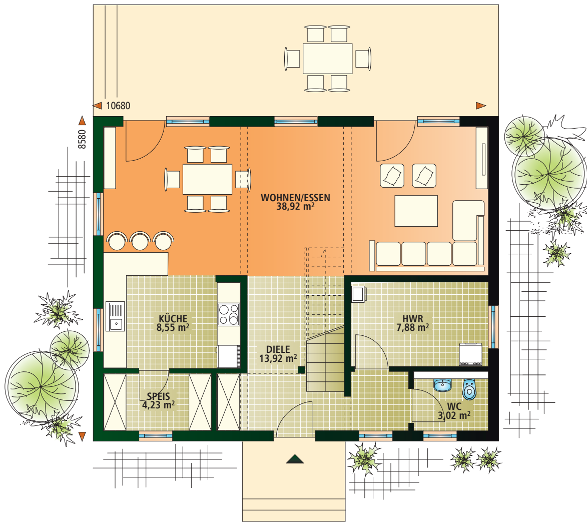
ERDGESCHOSS 76,52 m 2